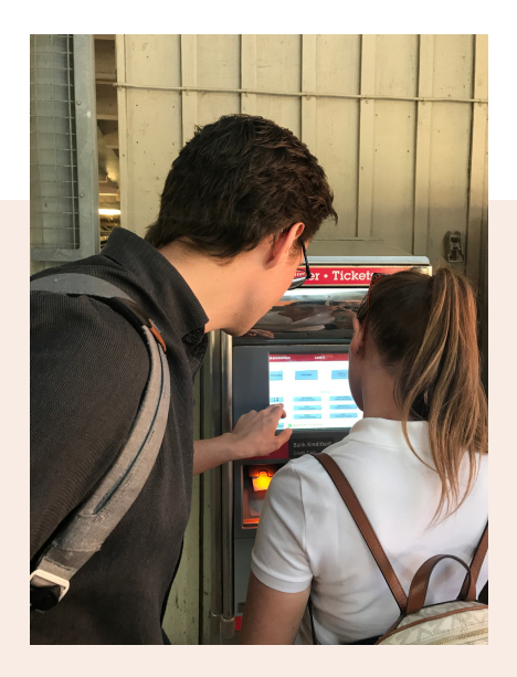
NB / FZK / JZK DURING A PROJECT WRITING TRIP IN MAY 2018. FZK & JZK ARE ACTIVE MEMBERS OF 4H DENMARK AND WRITE AND LEAD PROJECTS IN SCANDINAVIA & EUROPE.